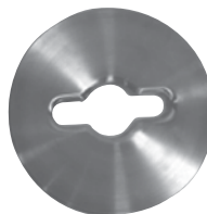
Recycling Lid for the 0038745